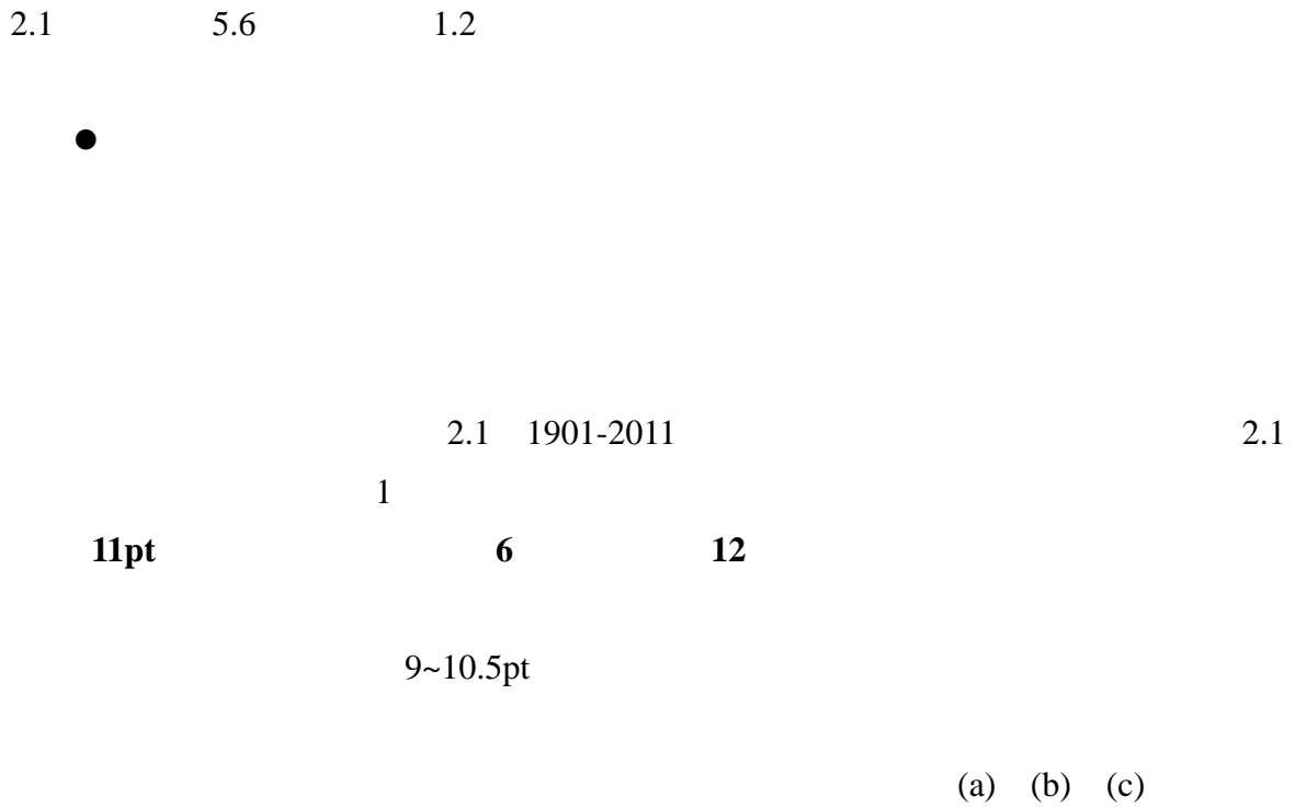
Fig 2.1 Distribution of annual mean temperature Northwest China from 1901 to 2011